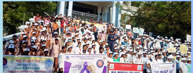
Walkathon in Kalaburagi