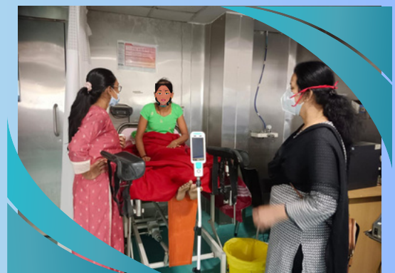
Colposcopy in progress