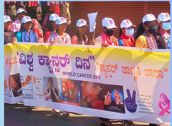
Walkathon in Bidar