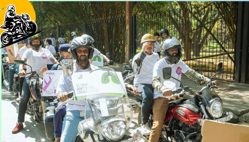
Bikers' rally in Bangalore