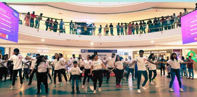
Zumba Dance in Nexus Mall, Bangalore